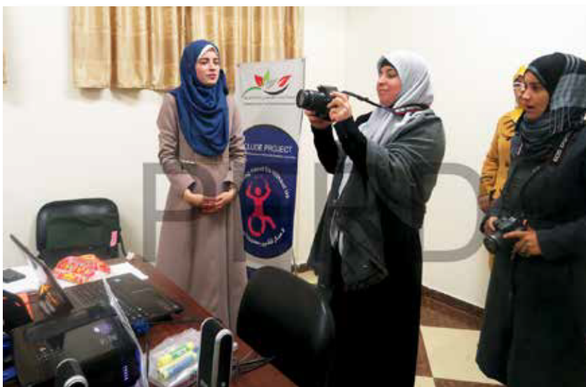
Palestine: Editorial staff of the magazine Voice of Women

In the framework of an inclusive path it is important to evaluate the work done by local stakeholders with a view to reaching empowerment and sustainability. The more widespread the