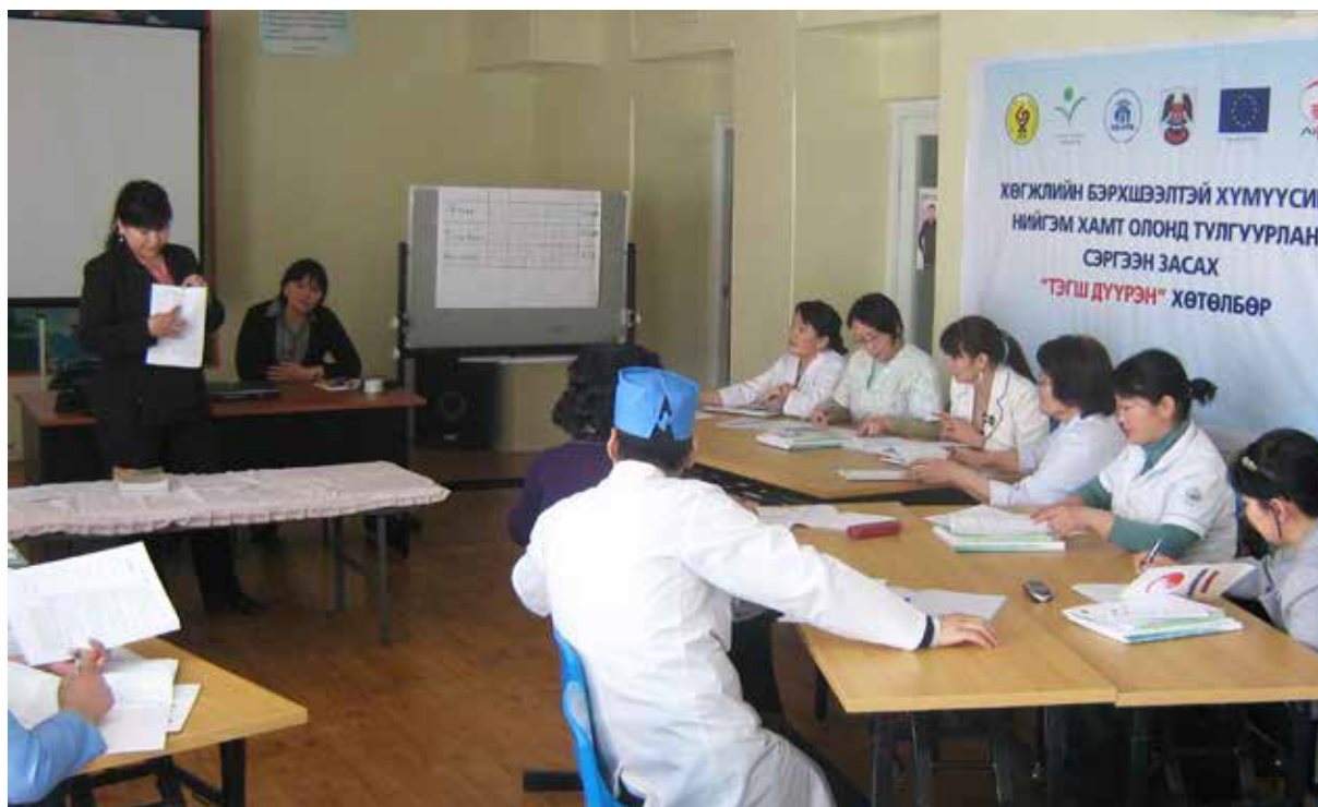
Mongolia: training activities for medical officers and health personnel

The selection of the first training group was done in collaboration with WHO and the Mongolian government, taking into account the sensitive political and institutional balance, CBR approach prerequisites and the objective of implementing the project nationwide. In fact, once trained, people would then have the responsibility to train local staff, on cascade, the true key to the success of any CBR programme.