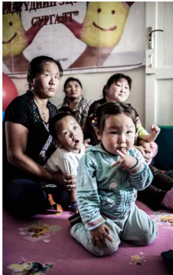
Mongolia: training of parents of children with disabilities

CBID programmes can be implemented on a small or large scale. Once the scope of action covered by the programme has been identified, the next step is the identification and training of the key figures in the local community: families, volunteers, teachers, medical personnel and paramedics. These people will be adequately trained on relevant issues related to the CBID approach such as: disability prevention education during pregnancy, early detection of disabilities in children, physical rehabilitation in collaboration with public health centres, vocational training centres, work integration or micro-credit projects for start-ups by persons with disabilities. Training then leads to the organization of activities, such as networking to enhance already available local resources: the local community, schools, places of worship, local associations, public health centres. This ensures social continuity to the implementation of the programme (Rabbi, 2011).