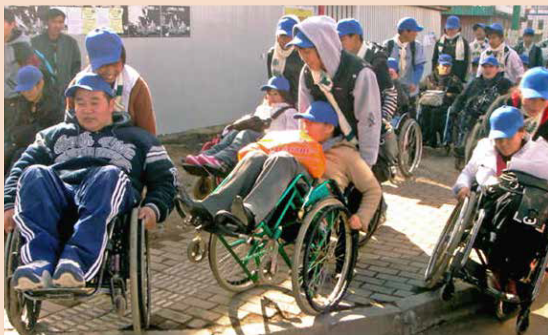
Mongolia: social inclusion activities

The participatory management of the technical groups is also reflected in accreditation obtained by RIDS members who have been called to submit the Action Plan in collaboration with and on behalf of MAECI, internationally, at the European Union 18 and at the UN level in New York 19 .