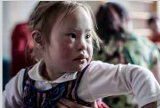
Mongolia: a girl with disability involved in CBR activities

Special schools still exist in many countries. Implementing education inclusion projects in these contexts does not mean “demanding” the closing down of these facilities, but rather developing and supporting transformation and enhancement processes in an inclusive perspective.