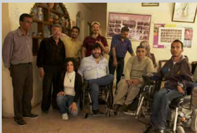
Palestine: Empowerment training of DPOs

This allowed the DPI Italy counsellor to find the right key to open the channel of communication with the Mongolian DPOs and know how to handle the situation that the empowerment process itself had generated.