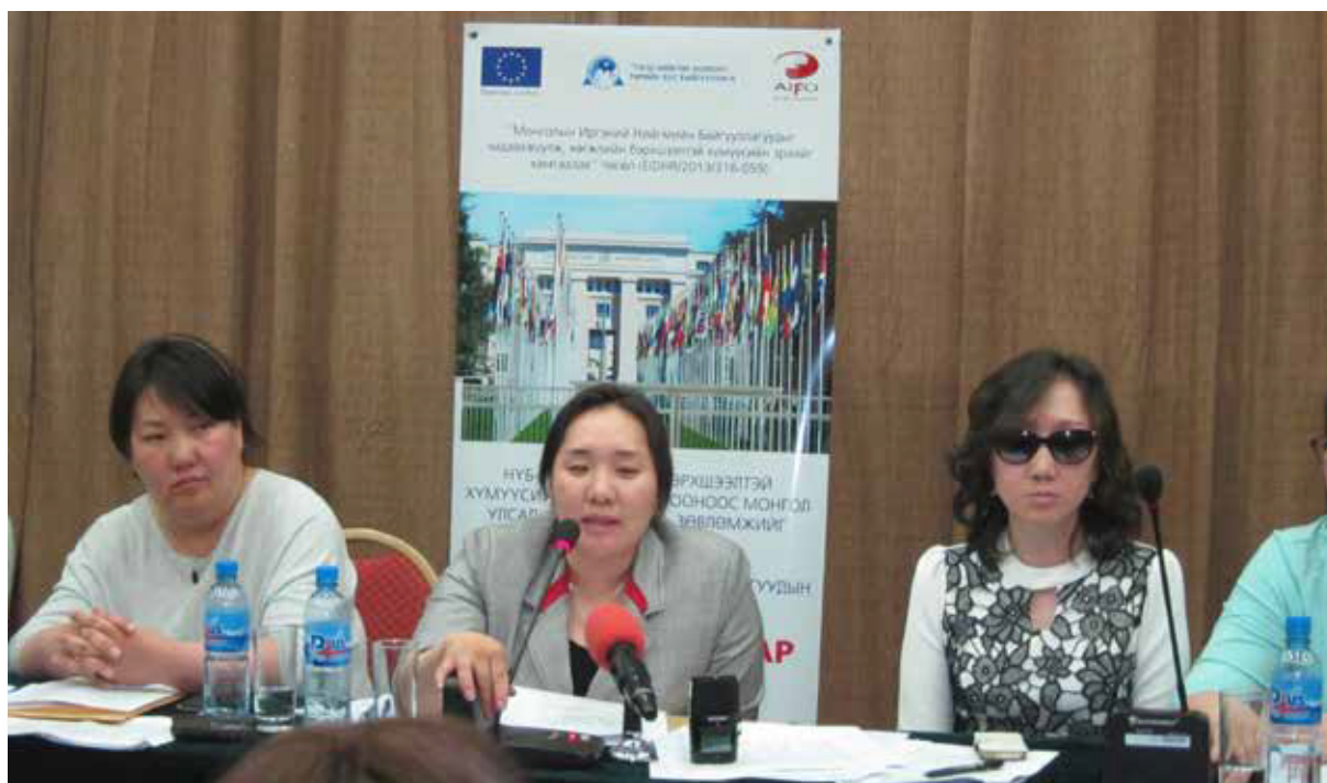
Mongolia: DPOs delegation during a press conference after presenting the list of issues to UN Monitoring Committee in Geneva

As for the empowerment, IDA 39 has contacted AIFO to train Mongolian DPOs to monitor the implementation of the Convention in Mongolia. In a few months, they were able to work together at the national level, to draft a list of issues to be submitted to the Monitoring Committee of the CRPD at the United Nations. In April 2015 a delegation of seven people with disabilities 40 – representatives of Mongolian DPOs – travelled to Geneva to explain the content of this important document and express their opinion