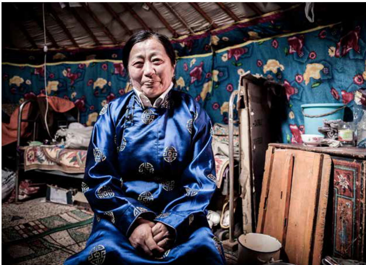
Mongolia: a woman with disability in her Ger

the medical personnel, by the community, by people with disabilities themselves and their families. Making visible what normally is not – i.e. disability, structural barriers and social and cultural potentials for the local community – and enhancing the professional and medical skills leads to a virtuous circle.