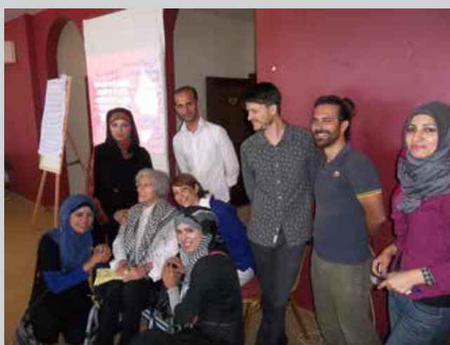
Palestine: empowerment of women with disabilities

The encounter with the RIDS network has meant a lot for EducAid, which has opened up to disabled people's organizations, such as DPI and FISH, offering the possibility to analyse discrimination from the point of view of those who experience it firsthand. EducAid has been able to gather this input and to reformulate its approach to work in Palestine by promoting exchanges between Italian DPOs and associations of women with disabilities, grassroots organizations and Palestinian DPOs, to begin working on empowerment both at the individual and at community level.