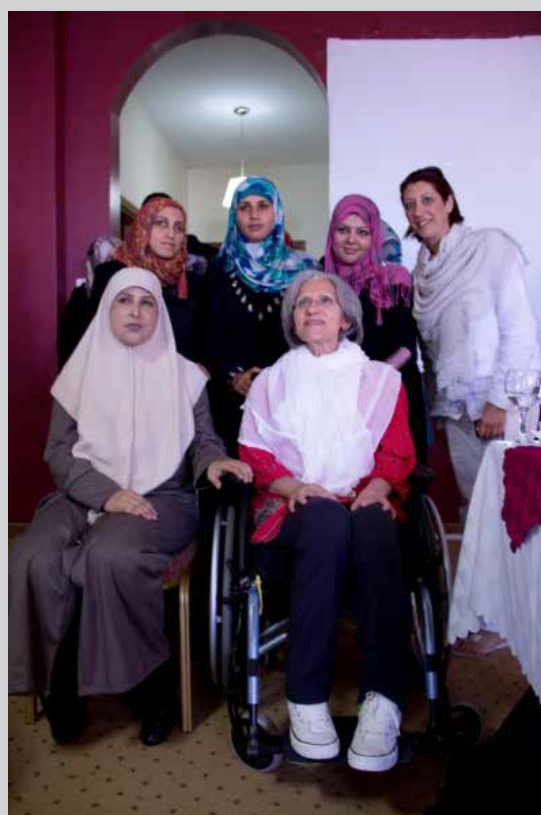
Palestine: empowerment of women with disabilities

The arrival of a woman in a wheelchair from Italy was a powerful symbolic message, which encouraged and motivated Palestinian women with disabilities. The challenge to overcome the political and cultural barriers that dot the way from Palestine to Italy was then revived and fully met, thanks to the project activity, which allowed a delegation of women with disabilities from Gaza to come to Italy in March 2015.