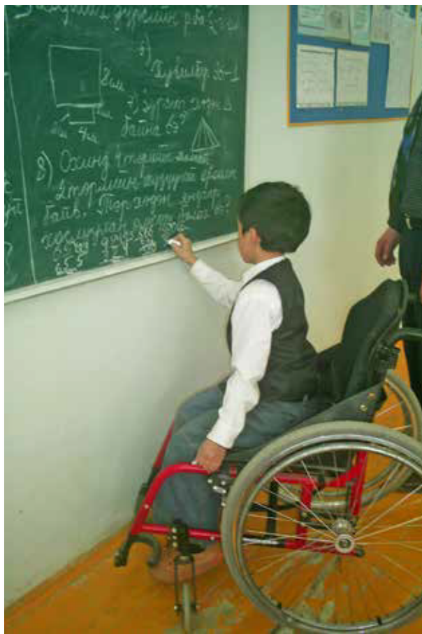
Mongolia: inclusive education's activities

Education is a right every human being is entitled to, a right that protects the quality of life of every person and country. Guaranteeing the right to education for all is the commitment that governments must undertake and be held accountable for, as underlined by international documents that interpret inclusion according to human rights based approach. In this regard, reference must be made to the Convention on the Rights of Persons with Disabilities 14 (CRPD) (UN, 2006), which in several passages reiterates the need to ensure equal educational opportunities to each person, as well as the Madrid Declaration and the UNESCO “Education For All” Programme, which emphasize the fundamental importance of education in all individuals’ lives. Proposing school as a place for all, based on the principles of participation and equality, is the first step towards an inclusive society.