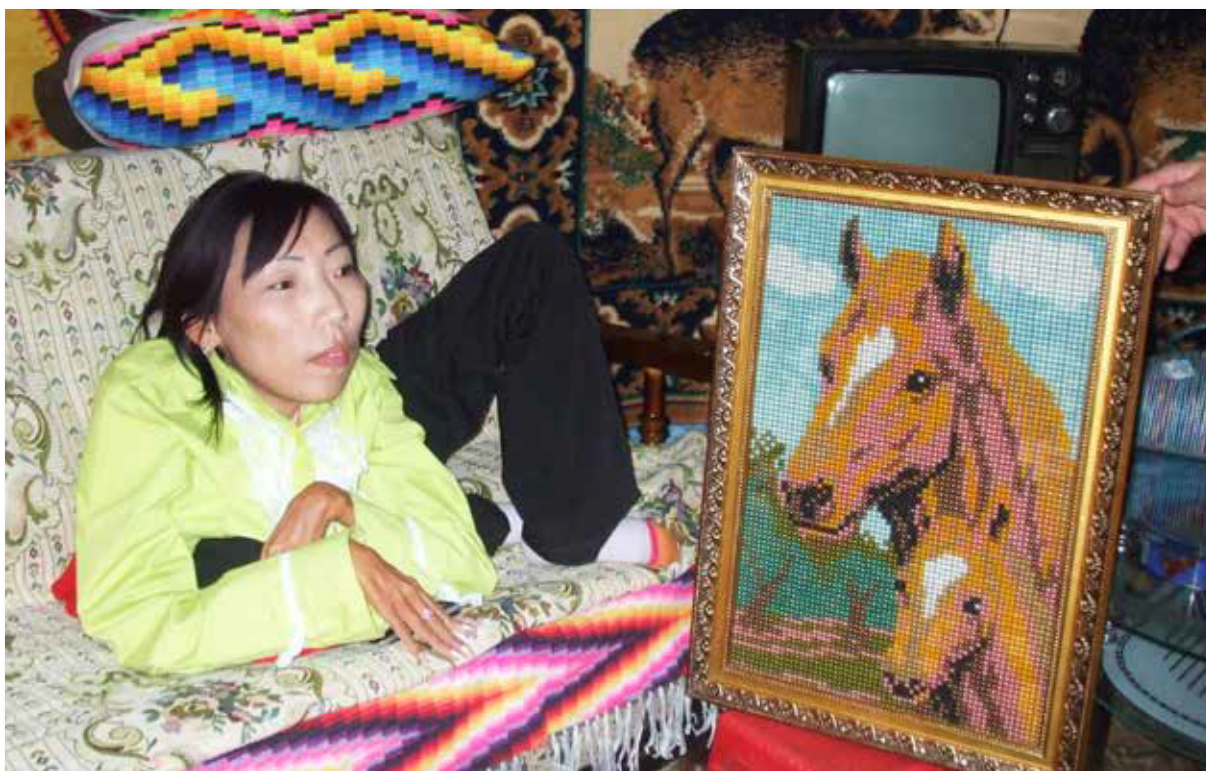
Mongolia: microcredit activities for starting small business and commercial craft.

At the same time, two globalization models are compared and contrasted: on the one hand, the globalization of rights, established by the United Nations in the aftermath of World War II, which has led to the progressive inclusion, among the rights holders, of