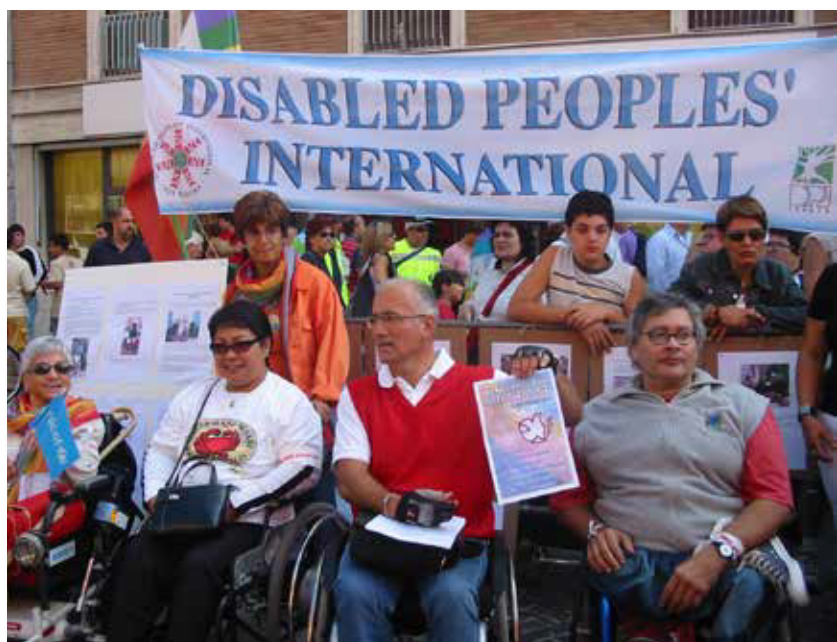
Italy: peace march Perugia - Assisi, 2005

It is fundamental to enhance the capabilities and skills of people with disabilities, by promoting them in technical, social and political fields. The implementation of self-advocacy processes enables people with disabilities to exercise all forms of active participation in their community, i.e.: cultural, based on respect for human rights, innovation in decision-making processes and in individual and collective awareness-raising processes. Supporting and enhancing the exercise of self-advocacy in co-operation projects is another form of “giving a voice” (and power) to persons with disabilities.