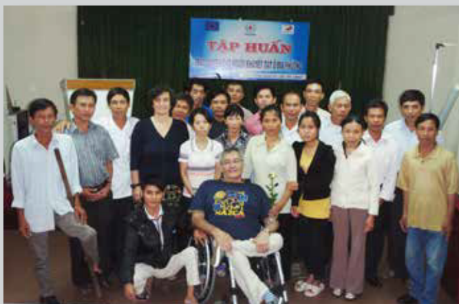
Vietnam: training course of DPOs

In this case, the peer counselor decided to shift the focus from collective to individual empowerment training in order to have more leeway of manoeuvre to introduce the key concepts related to the CRPD and thus offer people with disabilities the tools they needed to claim for and protect their rights.