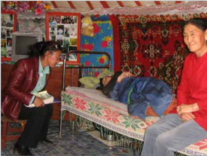
Mongolia: house visit of a CBR supervisor

The first goal of CBR workers is to provide the community with the tools to “see and hear” disability, to take it into account as a major theme for its development. The fact that CBR local committees are also composed of people with disabilities allows the emergence of obstacles and potentials of each community in the mapping. Only after this first step towards awareness-raising, can CBR personnel start working to remove the physical and cultural barriers and make the community an accessible place.