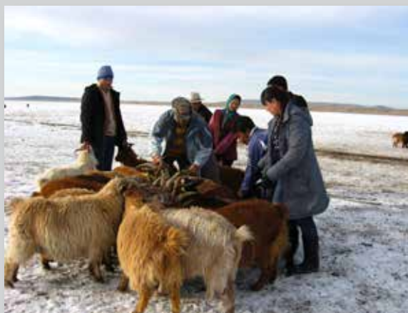
Mongolia: beneficiaries of cattle rotative fund

CBR deals with the social inclusion of people with disabilities within their communities. To own a flock for Mongolian nomadic populations is not just a source of wealth, but also of social prestige. Through the livestock revolving fund 15 , AIFO has managed to set a virtuous cycle in motion: people with disabilities and their families could thus improve both their economic and social status within their nomadic communities.