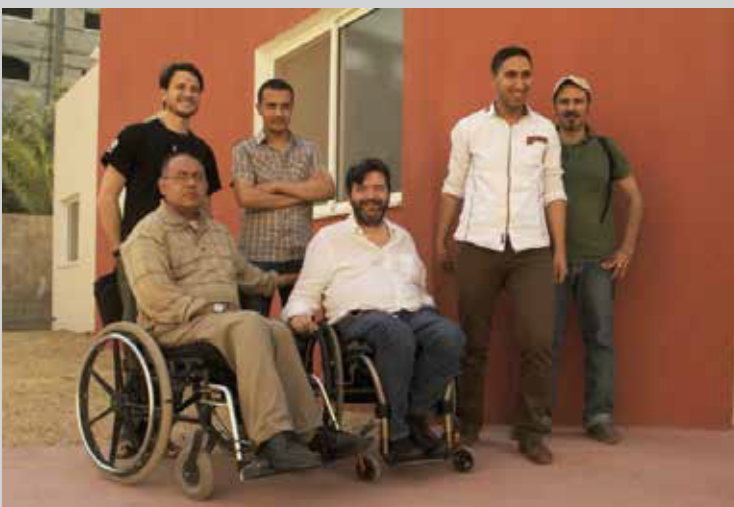
Palestine: training of local DPOs

The social empowerment concerns the associations of persons with disabilities and their families and it stems from the awareness that one of the causes of the lack or inadequacy of disability policies is due to the lack of recognition and enhancement of the role played by the associations of persons with disabilities in the promotion and protection of their rights. Strengthening and empowering these associations, so that they can address society as a whole, means providing an essential and indispensable contribution to social inclusion. In the field of international cooperation, training associations of persons with disabilities of a country means ensuring the sustainability of the CRPD by giving a voice directly to those who represent them 4 .