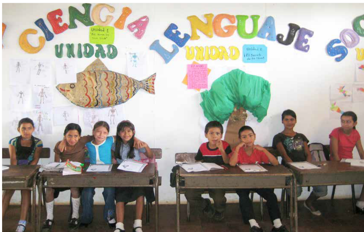
El Salvador: activities of inclusive education at public schools

The first project implemented by the University of Bologna and EducAid in El Salvador aimed at supporting the policies implemented by the local Ministry of Education (MINED) to ensure the right to education for all in public schools.