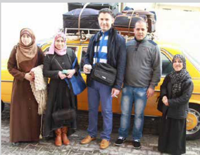
Palesatine: a delegation of women with disabilities for study visit in Italy

Accessibility is a multi-faceted process. If an NGO decides to cooperate with DPOs it should first start an in-depth analysis and re-organization process, including logistics as well, by paying special attention to this aspect. The organization of a trip by a delegation of people with disabilities, for example, requires great attention to several factors: i.e. the provision of the necessary papers, the personal care services to be booked in advance, duly equipped conference rooms and hotels, personal assistants willing to travel and so on.