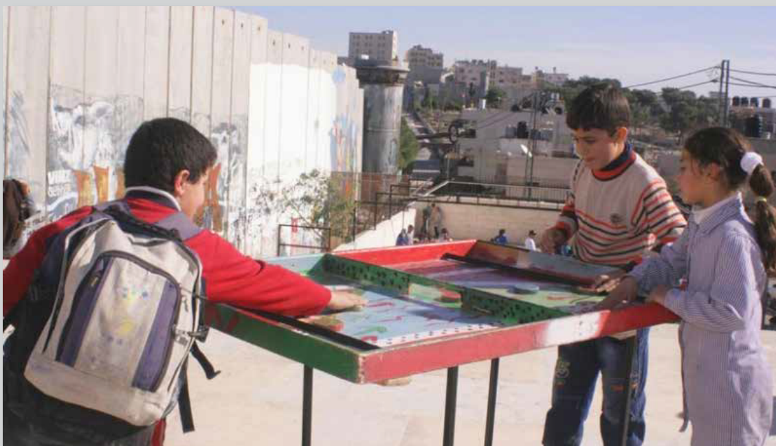
Palestine: inclusive education activities

first place. It is indeed necessary to train highly qualified education professionals with an expertise in social inclusion, to be able to design a school open to all.