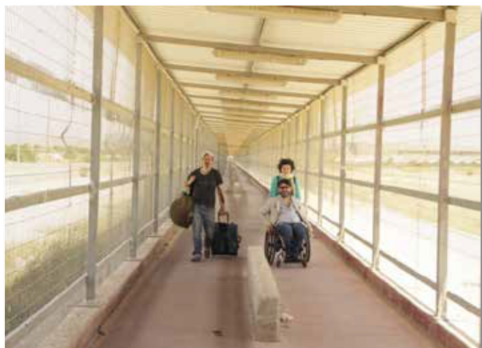
Palestine: check point to enter in Gaza Strip from Israel

Operating consistently with an inclusive cultural approach allows NGOs to reap full benefits, in the long run. In implementing its inclusive development project in Palestine, EducAid has always experienced inclusive practices, while maintaining an open dialogue also with those working with a different approach. In this way it has facilitated the opening of the world of education to inclusiveness, waiting for the cultural climate to ripen to allow the spread of change.