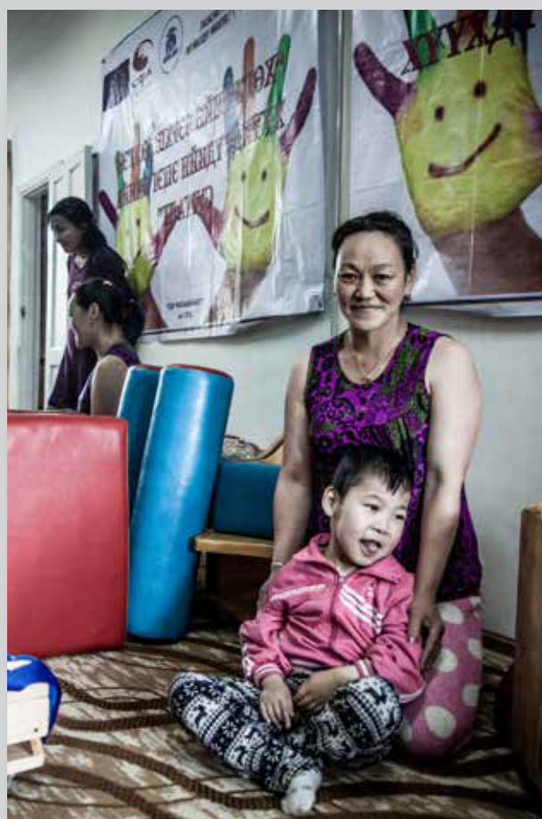
Mongolia: mother with child with disability involved in rehabilitation activities

Although the Salvadoran project does not include activities directly aimed at families, most of the parents of the students attending the pilot schools have been sensitized to the inclusion issue through active involvement in the initiatives promoted by schools: parents of children with disabilities have thus changed their educational relationship with their children, by implementing the suggestions offered by the inclusive education pedagogical project.