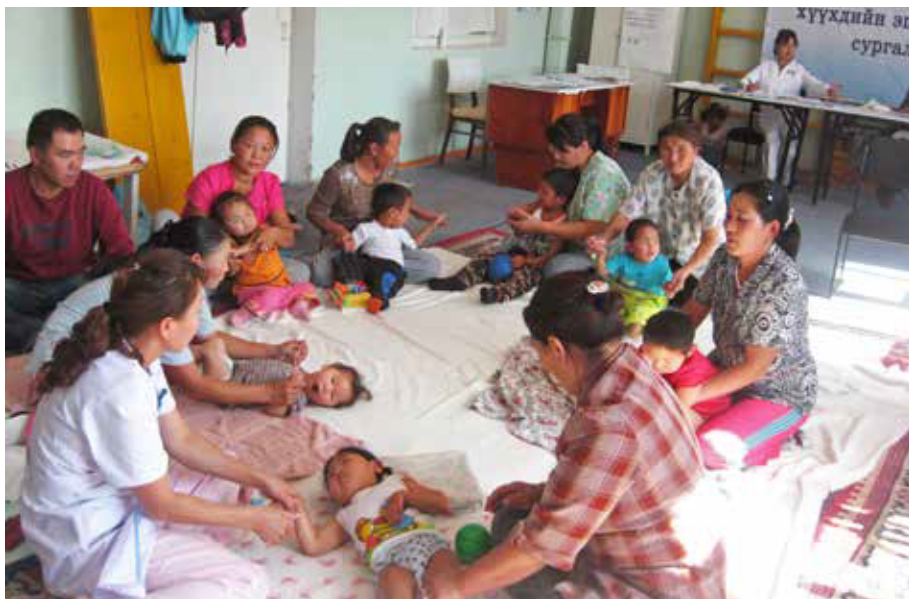
Mongolia: activities with mothers of children with disabilities at Health Centres

To ensure an appropriate CBR programme management, AIFO has committed itself to immediately setting up an ad hoc committee at each provincial level, composed of not only the medical staff, but also of a DPO or local grassroots association representative.