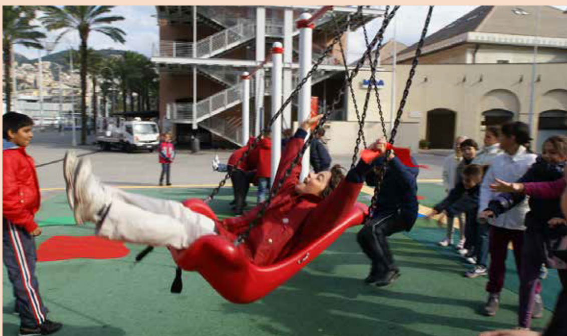
Italia, Genoa: inclusion activities and right to play

Thanks to this project, FISH has started the construction of playgrounds accessible both to children and parents with disabilities in various Italian towns.